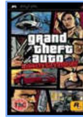
Grand Theft Auto: Liberty City Stories