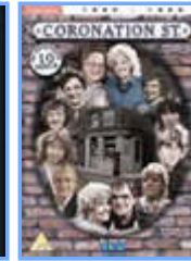
DVDs & Games for Xmas 2005