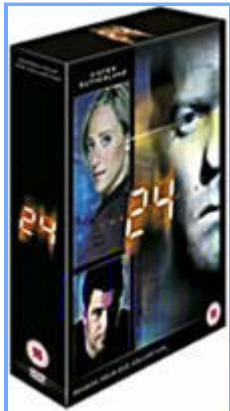
Season 4 & Season 1-4 Boxset