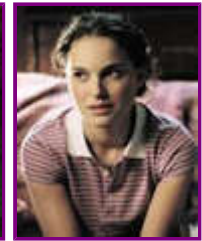
Natalie Portman interview