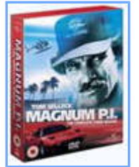
15 DVD COMPS!