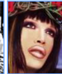
New music charts w/e 04.02.06